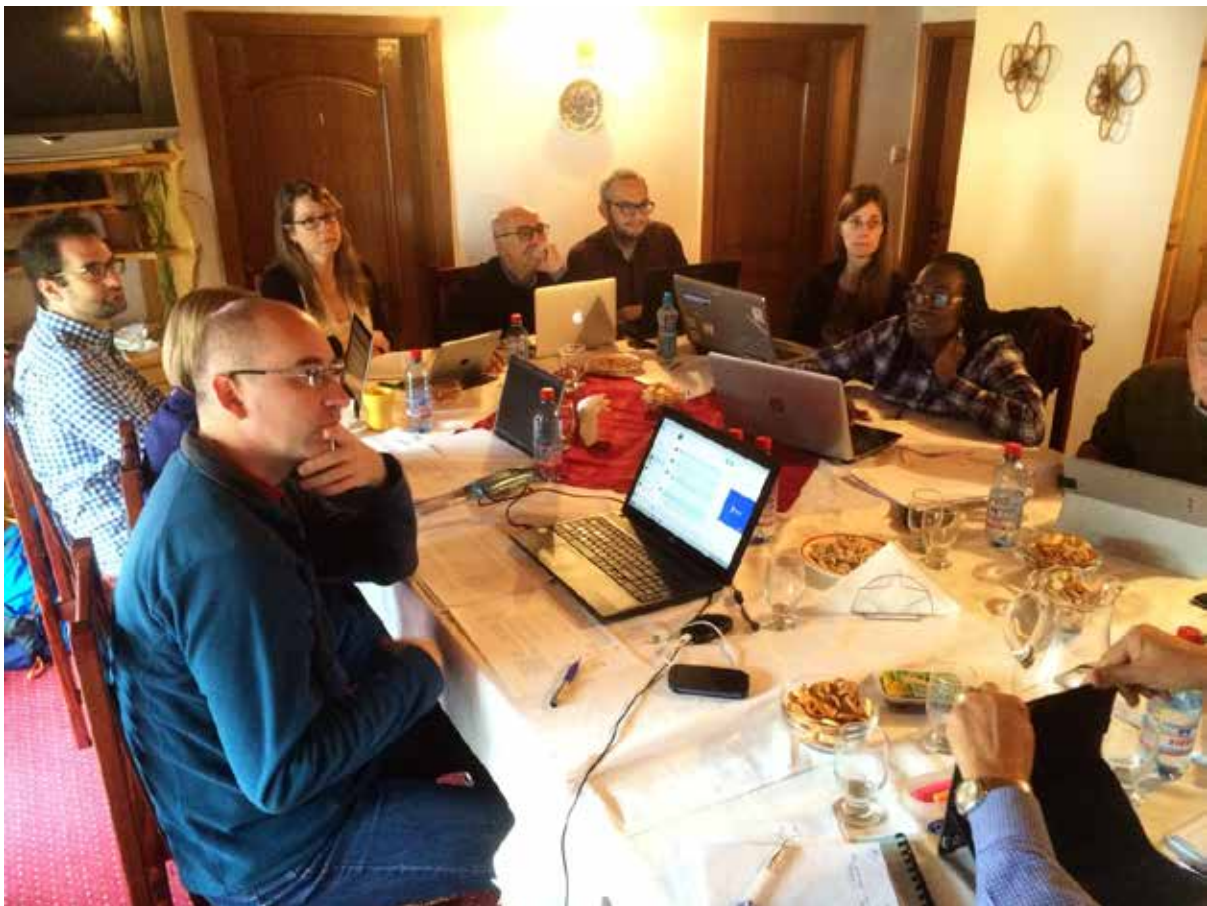
Dor de Moeciu, 31 May 2015.