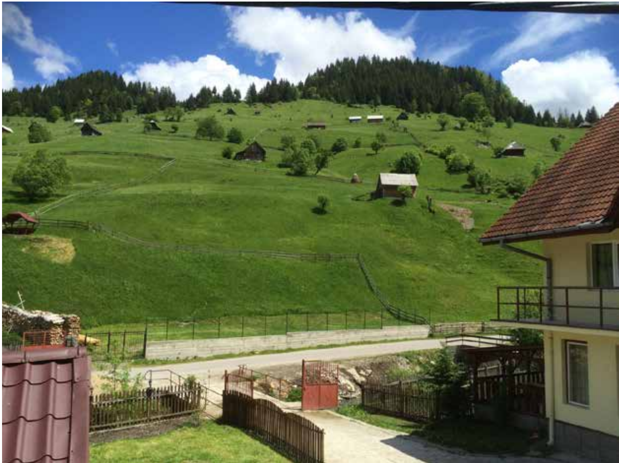
This is the hill or little mountain known as Moeciu 1,200m (or Moeciu de Sus 1,000m). I never really did get this resolved. This was the view from my bedroom balcony.

At the moment what I have created as the 'EGAD Moeciu Hora' (in Kopanitsa form) is a bastard hybrid – a bit like 'metadata'. I am not quite ready to through it away so maybe we could meet in Bulgaria and we could have this EGAD Kopanitsa as our theme.